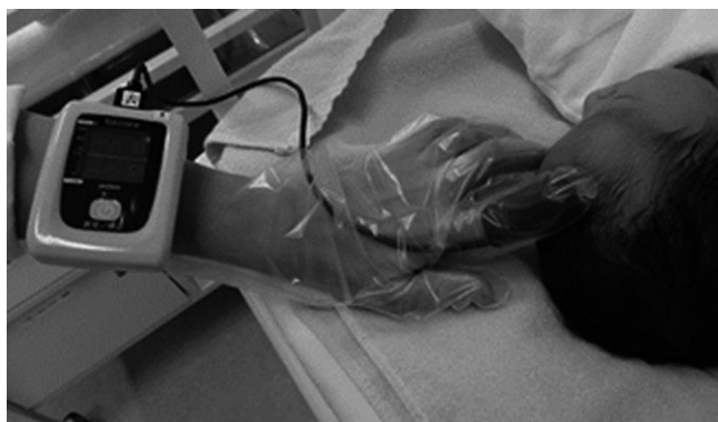
Fig. 1 The oximeter probe attached to the examiner's finger measuring regional cerebral tissue oxygen saturation on the head of a newborn (KN-15 NIRS; ASTEM, Kawasaki, Japan).

Measurements were performed during the first 10 min after birth. A stopwatch was set off when the neonate was fully delivered. All infants were dried and wrapped with warmed towels. Immediately after arrival of the infant at the resuscitation table, two people applied the transducers. First, one sensor was placed on the left frontoparietal area of the forehead (to measure crSO 2 ), and concurrently, transcutaneous pulse oximetry was initiated on a preductal level (right hand, to measure SpO 2 ). The infants were positioned supine and were breathing room air. A neonatologist observed the transition of the newborn infants and recorded Apgar scores at 1 and 5 min. After 10 min and a clinical assessment, the newborn infant was handed to the parents.