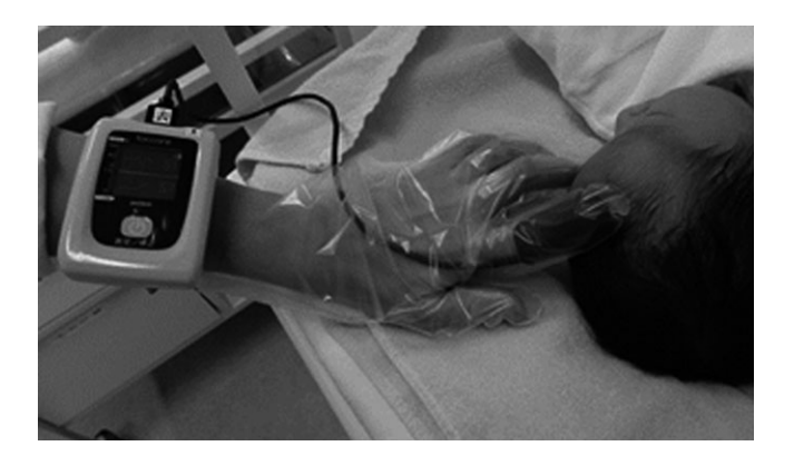
Fig. 1 The oximeter probe attached to the examiner's finger measuring regional cerebral tissue oxygen saturation on the head of a newborn (KN-15 NIRS; ASTEM, Kawasaki, Japan).

Measurements were performed during the first 10 min after birth. A stopwatch was set off when the neonate was fully delivered. All infants were dried and wrapped with warmed towels. Immediately after arrival of the infant at the resuscitation table, two people applied the transducers. First, one sensor was placed on the left frontoparietal area of the forehead (to measure crSO<sub>2</sub>), and concurrently, transcutaneous pulse oximetry was initiated on a preductal level (right hand, to measure SpO<sub>2</sub>). The infants were positioned supine and were breathing room air. A neonatologist observed the transition of the newborn infants and recorded Apgar scores at 1 and 5 min. After 10 min and a clinical assessment, the newborn infant was handed to the parents.